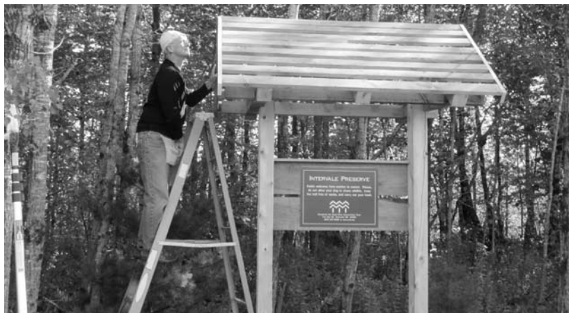
Projects included construction of a kiosk with explanatory signage.