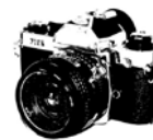
Photo Contest Winners Announced