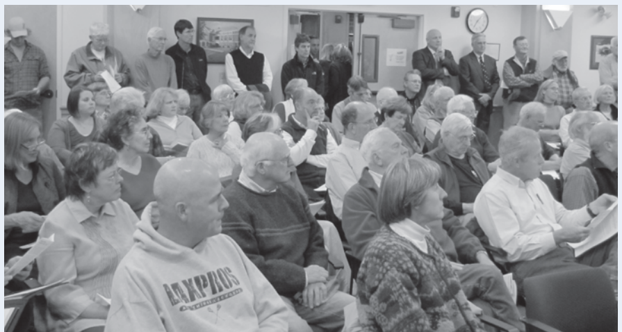
Seventy-five people attended the second of two forums on the Royal River's dams, sponsored by RRCT and Maine Rivers. See story on page 4.