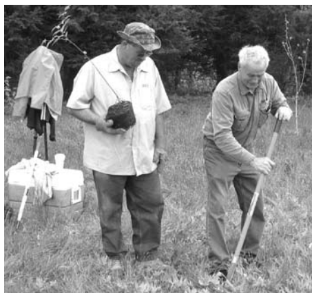
Wal-Mart employees planted nearly 500 trees on the Chandler Brook Preserve this May

continue to open our properties to the public, please bear this in mind, and tread lightly. We promise to do the same.