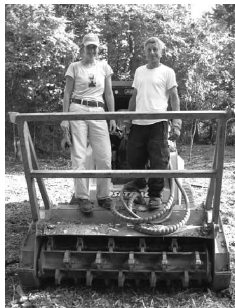
Stewardship looms large – and motorized – at the Littlejohn Island Preserve