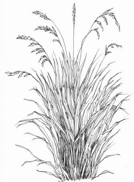
Deschampsia

We are extremely grateful to each of these organizations for their confidence in and support of our programs.