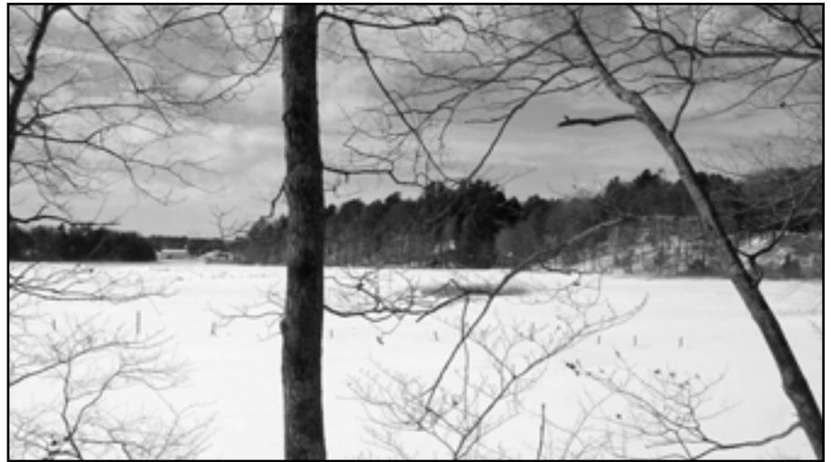
Marsh acquisition under a blanket of snow from the March 8th storm, as seen from a Bayview Estuary Preserve trail.