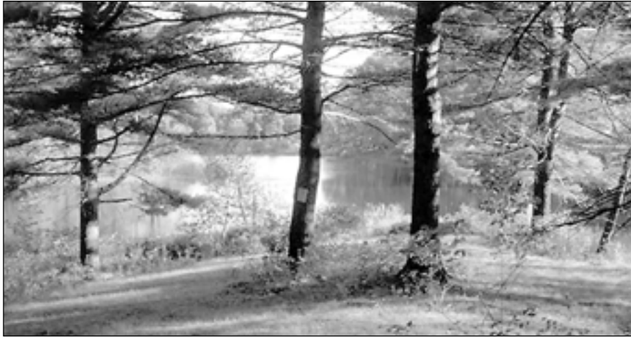
Freshwater Pond at the Bayview Estuary Preserve