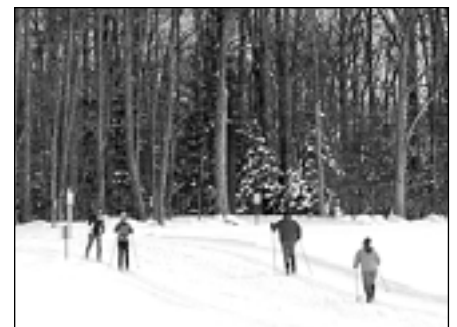
Skiing at Pineland.

Demand for public access to waterways and open land is certain to grow in the years to come, if only because it is a Maine birthright that has already been seriously eroded by development. Helping to provide access through carefully conceived projects that are sensitive to landowners' needs as well as those of the public is an important role for land trusts, including Friends of the Royal River.