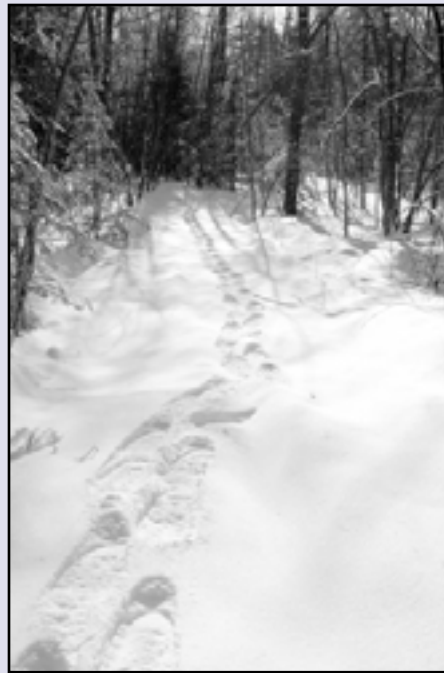
Fresh snowshoe tracks on one of the many trails at the Chandler Brook Preserve in North Yarmouth.